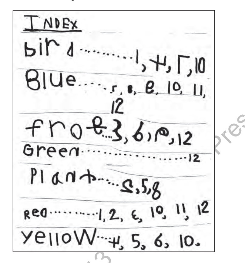
FIGURE 3.1. A child's index for Rainforest Colors (Canizares & Chessen, 1998).

an index or a table of contents, headings, and subheadings, which will help move them toward meeting Standard 5. They might add captions to photos or illustrations or a back cover blurb articulating the purpose of the text, addressing Standard 6. This activity can include a range of types of informational text; for example, numbers could be added to the steps included in directions/procedural/how-to text, or headings could be added to sections of a biography.