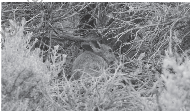
FIGURE 1.1. Pygmy rabbit from the NSF video Food and Fear .

Combined, these details reveal another main idea—that scientists are systematically investigating the life of the pygmy rabbit, using multiple methods. As a result of this systematic investigation, the scientists understand what the rabbit requires of the habitat it lives in. These details are conveyed through the images shown (see Figure 1.1) and the choice of words used in the narration.