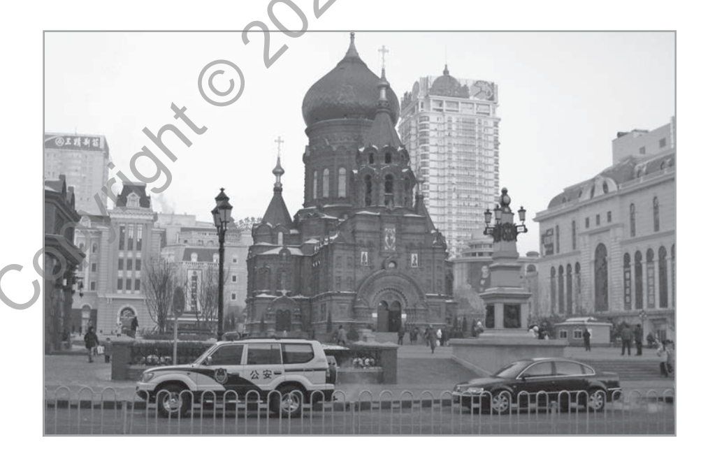
FIGURE 9.1. A former Russian Orthodox church in Harbin, now a museum, testifies to the strong Russian presence in northeast China between 1880 and 1940.

How is Russia today different geopolitically from the U.S.S.R.: First, it is much smaller. Although Russia did retain the bulk of the richest extractive and manufacturing zones and about 70% of Soviet manufacturing capacity, it lost access to about half of the productive agricultural areas in Ukraine, Kazakhstan, Georgia, and Uzbekistan; some essential mining areas (chromium and uranium ores in Kazakhstan,