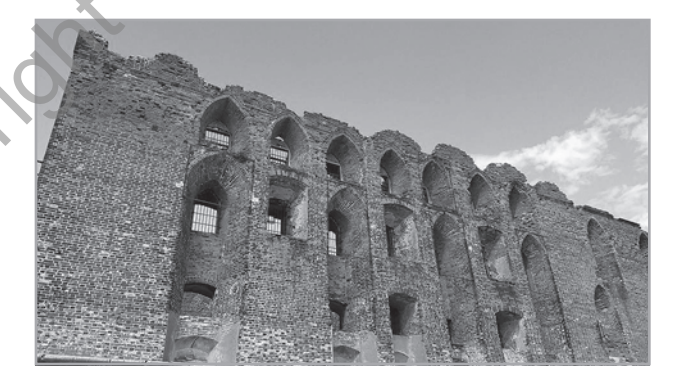
VIGNETTE 9.1, FIGURE 1. Ruins of the medieval German castle in Neman (Ragnit), Kaliningrad Oblast.

The strategic importance of this exclave lies in its geographic position close to Europe and in the southern part of the Baltic Sea. The city of Kaliningrad is the closest port in Russia to Europe. Because of its southerly location, it is also the only Baltic Sea port that does not freeze in winter. About 14 million metric tonnes of goods pass through the port every year. There are separate oil, general cargo, and fishing divisions. The oblast enjoys a special economic zone status with favorable tax rates for foreign investors, to stimulate local industry. It is also one of the few areas where Russia can locate its early-warning radiolocation stations to keep an eye on possible NATO expansion and can stage its antiaircraft missile complexes and fighter jets. The latter is very controversial because Russia has a number of advanced systems already deployed that may be in apparent violation of earlier missile treaties. Finally, the region has a high tourism potential because of its sand dunes and pretty beaches, as well as cultural landmarks (Figure 1).