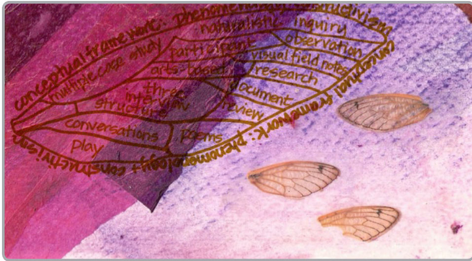
FIGURE 19.9. Collage by Lisa Kay: cicada wings, marker, tissue paper. From Kay (2013b). Copyright © Lisa Kay. Reprinted by permission.