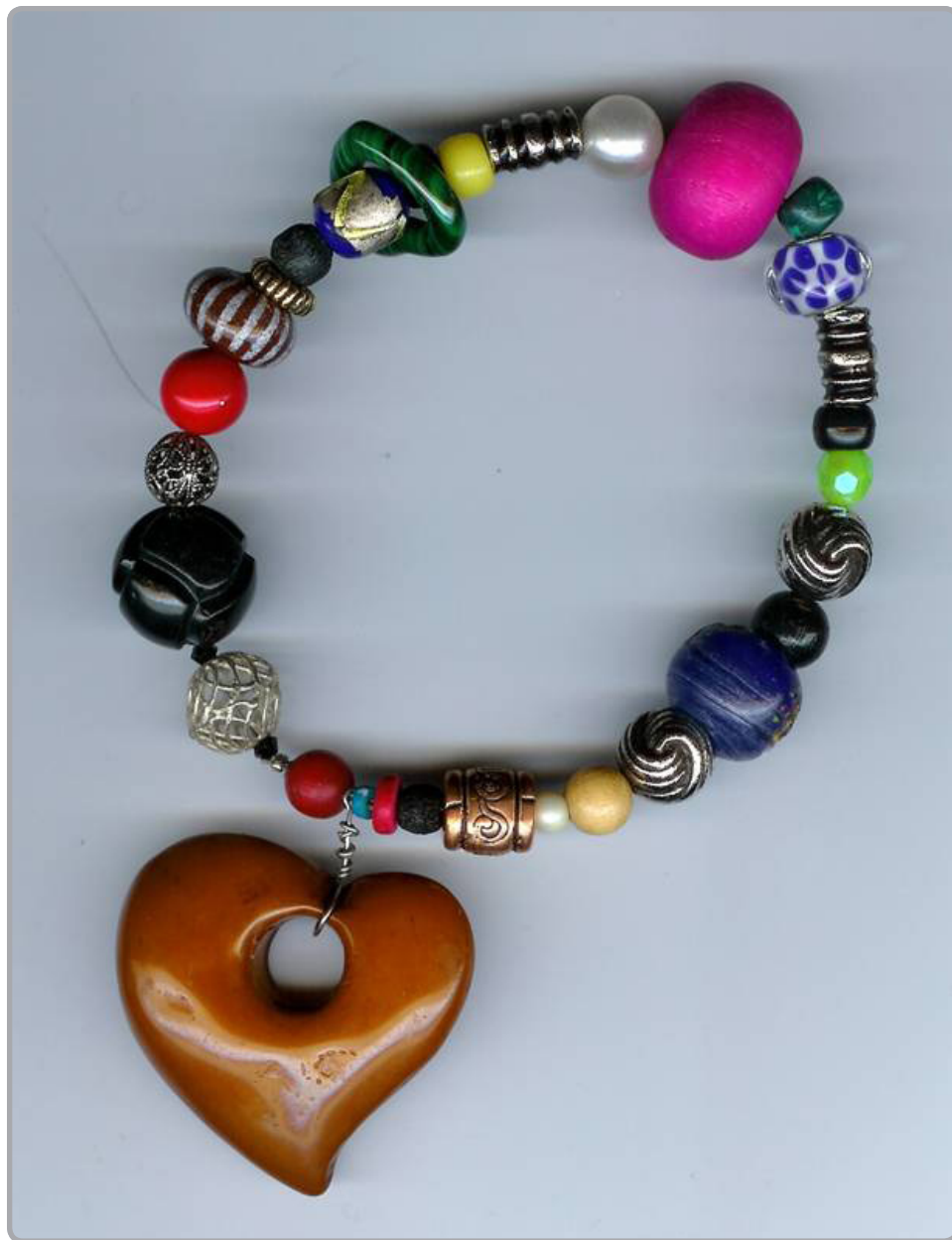
FIGURE 19.3. Louise's bead collage: beads/found objects, 7.5." From Kay (2013a).