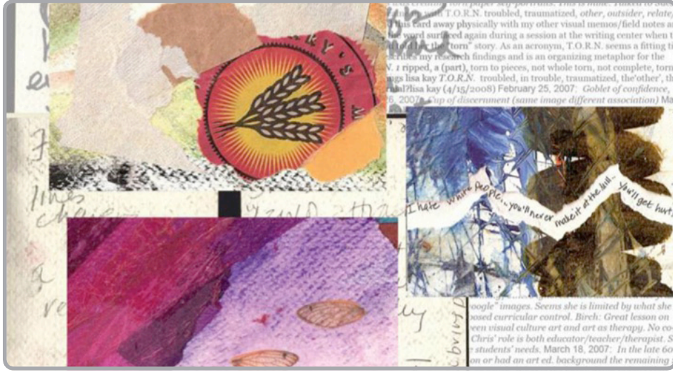
FIGURE 19.10. Digital collage by Lisa Kay using original artwork, reflective text, handwritten notes, and photographs. From Kay (2013b). Copyright © Lisa Kay. Reprinted by permission.