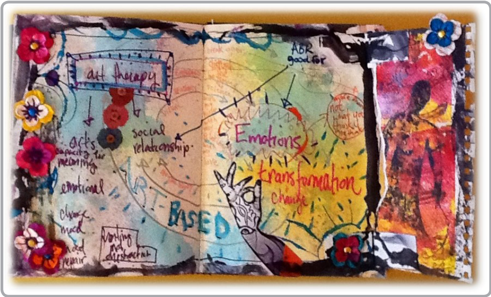
FIGURE 19.8. Literature review concept map by Gioia Chilton. From Chilton (2014). Copyright © Gioia Chilton. Reprinted by permission.